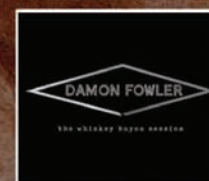
DAMON FOWLER THE WHISKEY BAYOU SESSION