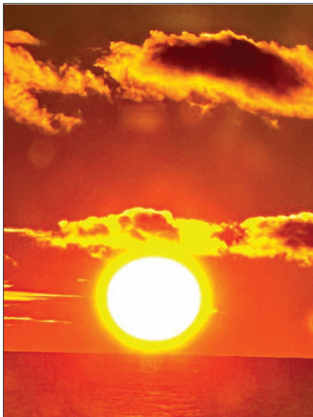
Last sunset of the year! Empire, MI 12/29/23

I'm in love with my electric blanket. From minus zero degrees in Leelanau County to 88 degrees in Tampa, Florida. We traveled through the highway to hell. First our furnace died - it took a week to fix in zero degree weather. Then our pipes froze and then all the power in our neighborhood failed. It was time to move south! We got packed and moved to our old house in Royal Oak for our last visit with the Henry Ford doctors. Then as a polar vortex covered most of the U.S. we attempted to slowly go south. It was zero degrees all the way to Nashville that should have been completely shut down because they have no salt or snowplows, and inexperienced winter drivers. We stayed at a Hampton Inn in Columbia, TN south of Nashville which barely had heat (only a.c.) and no salt or snowplows but bed bugs and a complete nightmare! There was no snow in Alabama and onward to Florida to