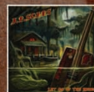
JP SOARS LET GO OF THE REINS