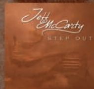
JEFF MCCARTY STEP OUT